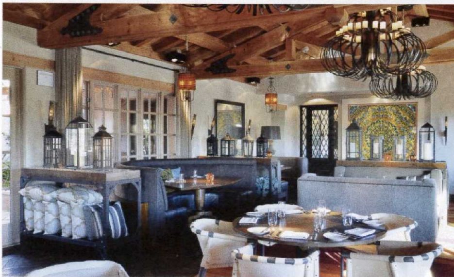
The revamped Veladora (bottom) features a lobster and burrata salad (top).

Details: Lunch and dinner daily. At dinner, starters are $12 to $17 and entrées are $25 to $42. Full bar. Rancho Valencia Resort, 5921 Valencia Circle, Rancho Santa Fe, 858-759-6216.