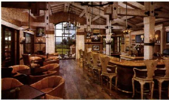
CLOCKWISE FROM LEFT The resort's equestrian-themed bar is playfully called The Pony Room and serves Prosecco on draft; The spa features ten beautifully tiled treatment rooms complete with private outdoor patios; The Veladora restaurant features chef Eric Bauer's "Coastal Ranch" cuisine.