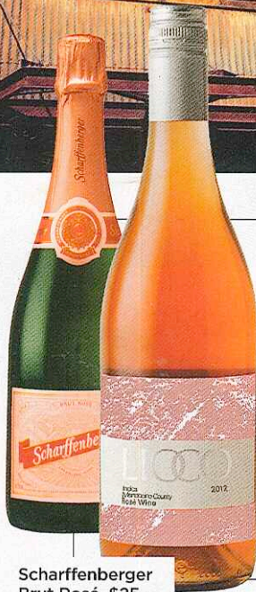
Scharffenberger Brut Rosé, $25. 2012 Lioco Indica Rosé, $16.