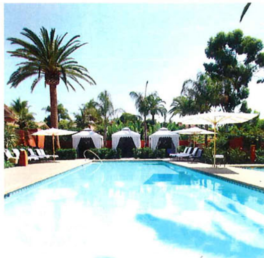
The pool and cabanas at Rancho Valencia.

Tucked away in exclusive Rancho Santa Fe, Rancho Valencia, an Auberge Resort, is a 40-acre oasis of tranquility.