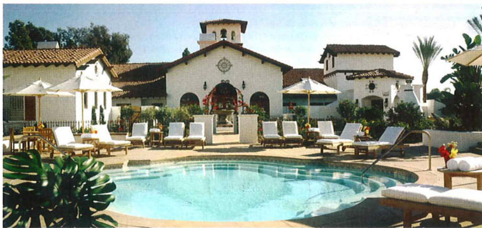
The courtyard of the Spa at La Costa.

The world-famous Chopra Center at La Costa complements the Spa at La Costa with cutting-edge mind/body programs.