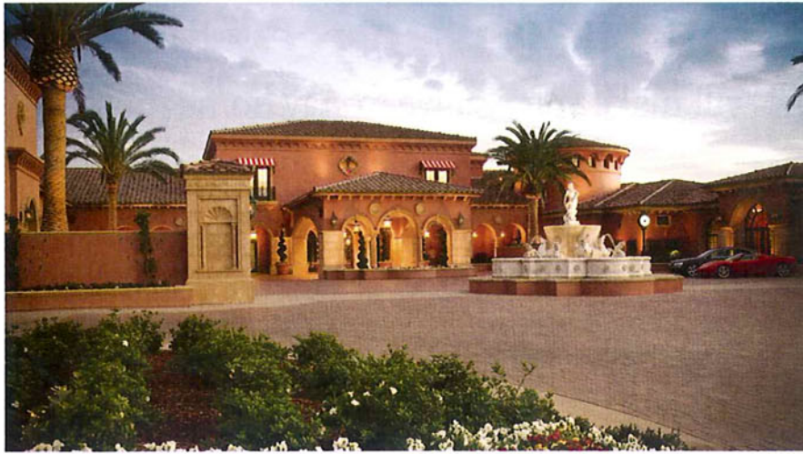
The Grand Del Mar entrance.