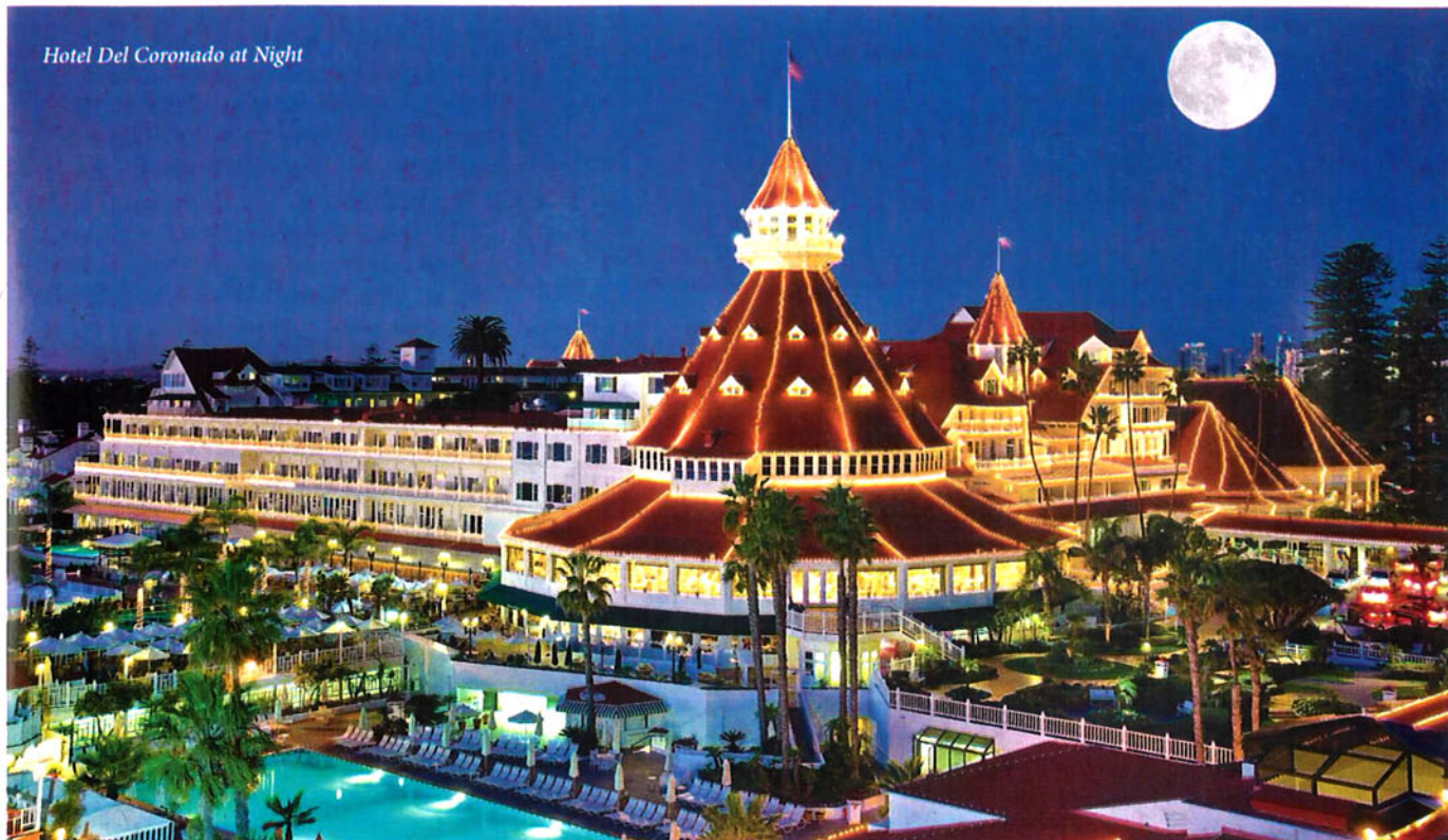
Hotel Del Coronado at Night

Luxurious Staycations that will make you resolve to stay home more often in the new year