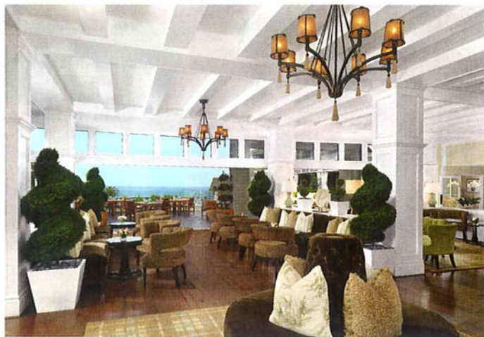
Main lobby of L'Auberge.

A standout, the Gandharva Therapy is an Ayurvedic massage performed with energy and marma therapy, incorporating healing sounds of the crystal singing bowl. Treatment rooms are acoustically designed to transfer the sound of the bowls during the massage to awaken your senses. The incorporation of Eastern modalities provide the guest with a meditative and relaxing experience that is hard to come by. (lacosta.com)