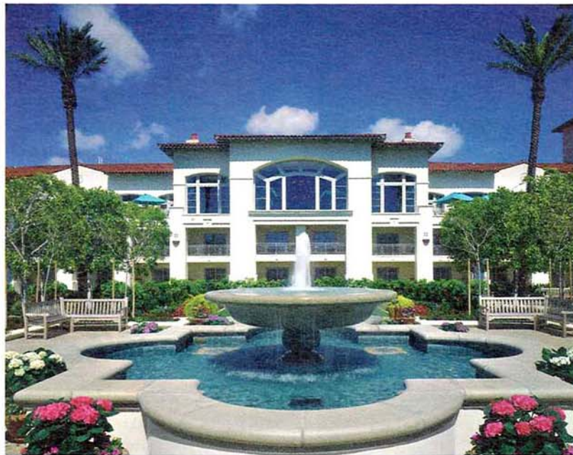
The Four Seasons brings its signature sophistication to the area, along with Pacific Ocean views.

Beyond food and wine, Del Mar and the surrounding area have much to offer. Pampering abounds at the high-end resorts, which feature an array of body and face treatments for women, men and