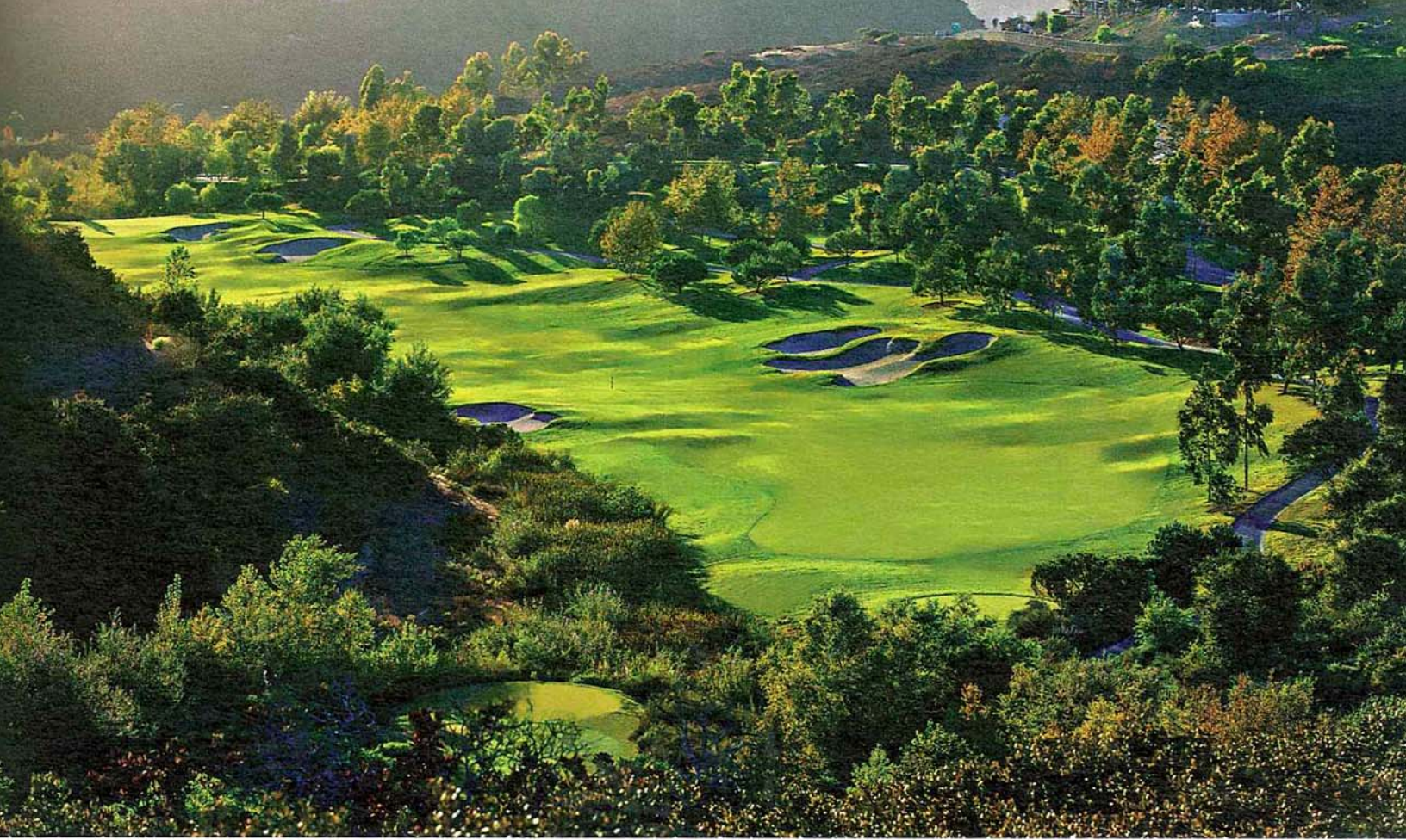
The beautiful weather in Del Mar makes the location perfect for golfing. Aficionados of the sport have a number of options, including the Tom Fazio-designed course at the Grand Del Mar.

of consideration: Market and Arterra. If you must have a view of the water, Pacifica Del Mar is a good choice and also holds an Award of Excellence. A short drive south will bring you to the area's only Grand Award winner, WineSellar & Brasserie. It's worth the trip.