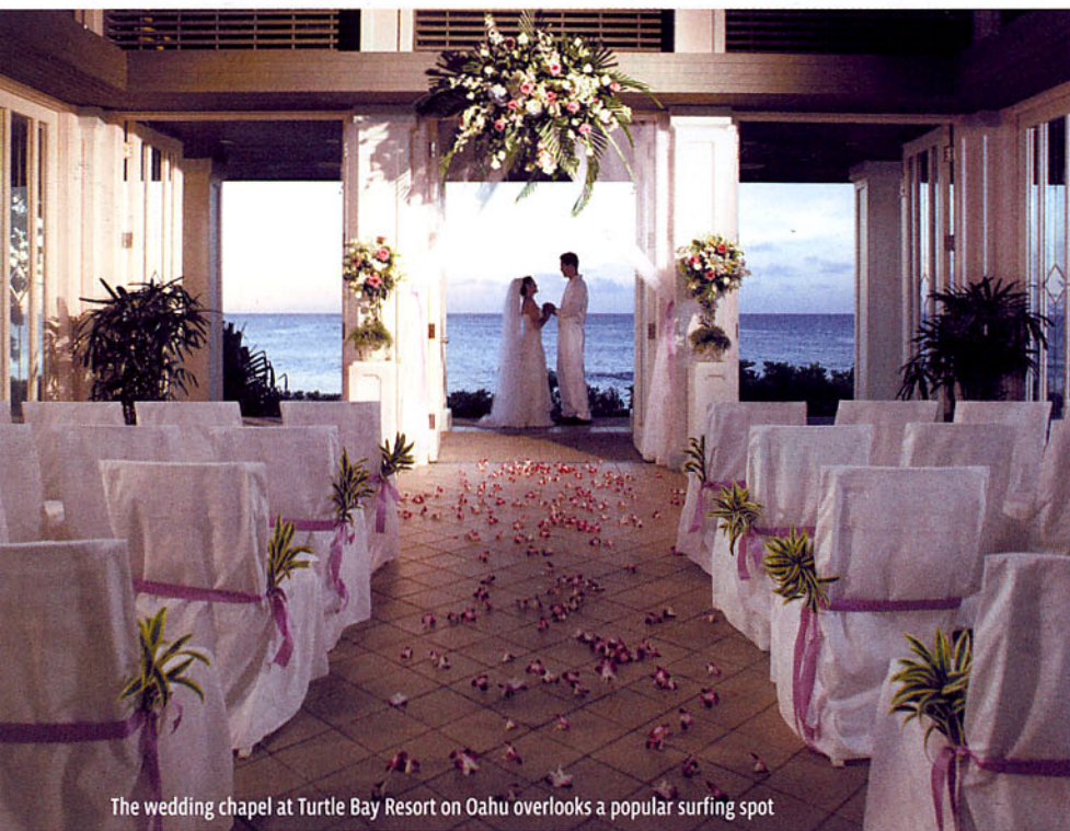
The wedding chapel at Turtle Bay Resort on Oahu overlooks a popular surfing spot