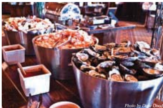
C. Photo by Dave Good