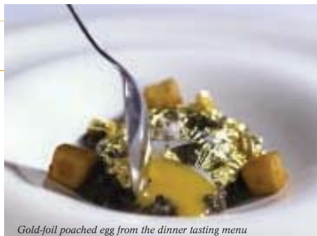
Gold-foil poached egg from the dinner tasting menu