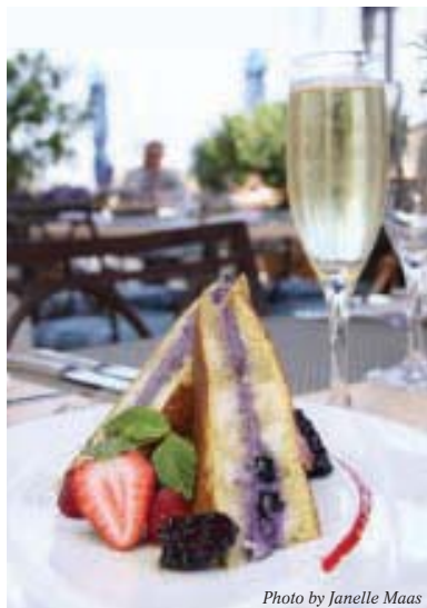
A.