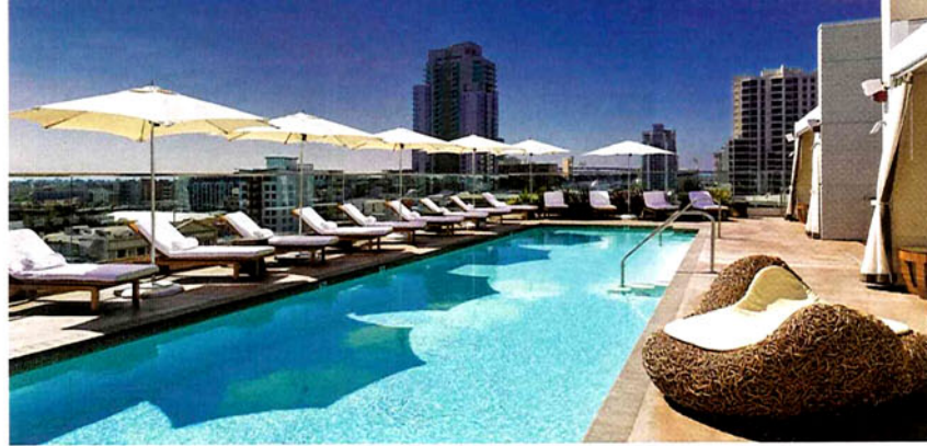
CLOCKWISE FROM ABOVE: The pool at the Ivy Hotel; the 14th hole at Torrey Pines Golf Course; Untitled by Pablo Picasso

BEST PLACES to live, work, play—there's hardly a top 10 list these days that doesn't proclaim San Diego the greatest. So what's the hype all about? Take the two-hour drive south to find out for yourself.