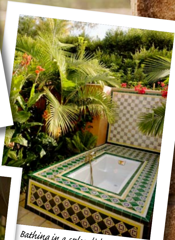
Bathing in a splendid natural setting is another relaxing option.