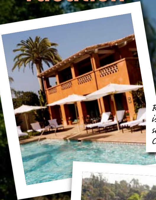
Rancho Valencia's pool is the perfect place to soak in the beautiful California sun.