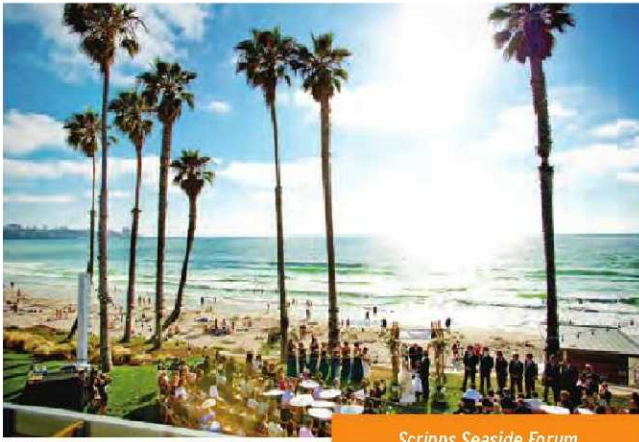
Scripps Seaside Forum